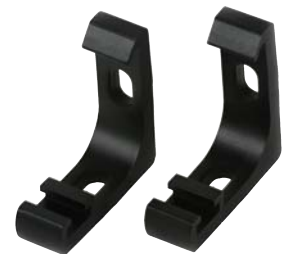
Standard Wall/Ceiling Brackets

Optional Elite ZR800D Universal Learning Remote Control, allows one-touch regulation over your entertainment system managing up to 8 devices simultaneously. Each unit has a simplified programming option with learning function to accompany 800 pre-programmed TV/DVD/VCR codes.